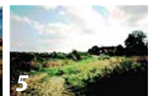
3 Great Meadow Way (corner of Woodmans Croft) 4 Hickman Street looking towards the school 5 Swallow Lane looking towards the Farm / Rectory