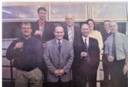
The First Parish Councillors

The first group of residents to start taking an interest in the management of Fairford Leys was the Fairford Leys Residents Group; made up of several residents. They were later asked to consider standing for election as parish councillors and several of them did and were elected councillors.