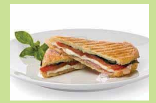
Come and try our snack menu