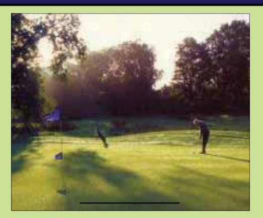
AYLESBURY PARK GOLF CLUB Andrew's Way, Fairford Leys Aylesbury HP17 8QQ