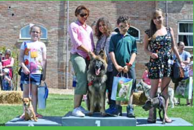
Cutest Puppy Winners