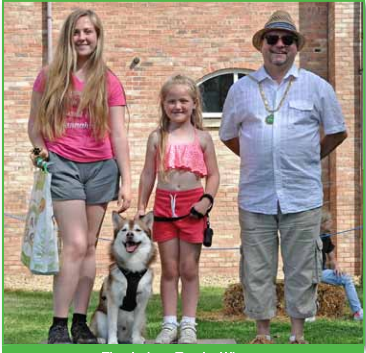
The Judges Trophy Winner