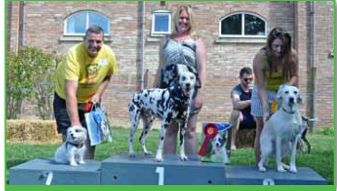
Waggiest Tail Winners