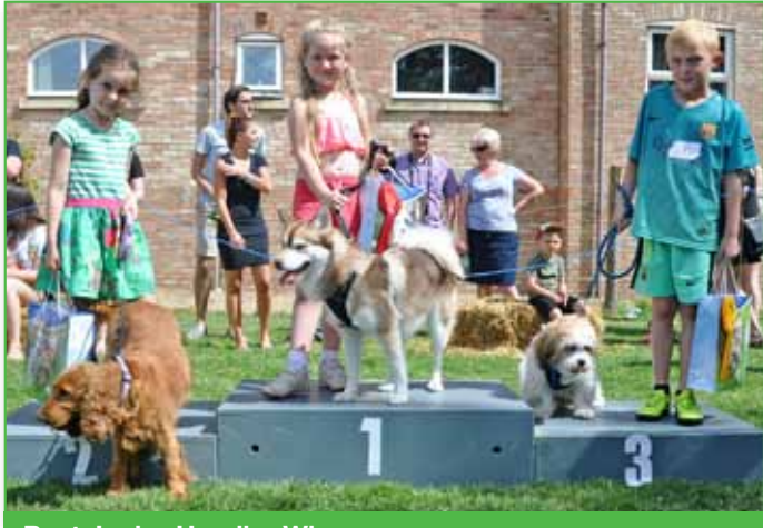
Best Junior Handler Winners