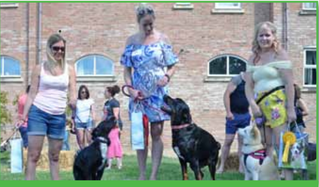
Prettiest Girl Dog Winners