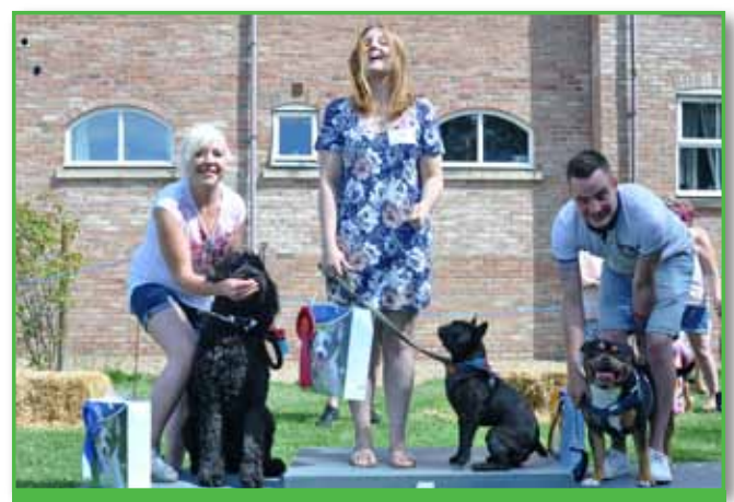
Most Handsome Boy Dog Winners