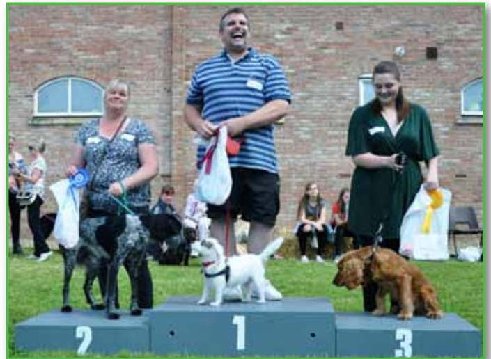
Waggiest Tail Winners