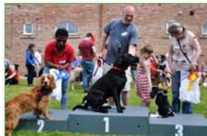
Most Handsome Boy Dog Winners

Most Handsome Boy Dog sponsored by Destiny Hair Design and Prettiest Girl Dog by Cutlers Barbers.