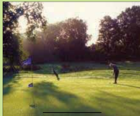
AYLESBURY PARK GOLF CLUB Andrew's Way, Fairford Leys Aylesbury HP17 8QQ

www.aylesburyparkgolf.com Enquiries Tel: 01296 399196