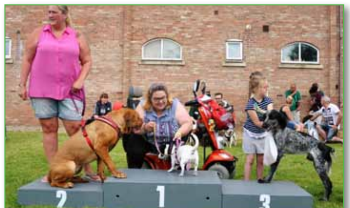
Fastest to Sit Winners