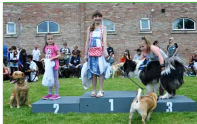
Best Junior Handler Winners