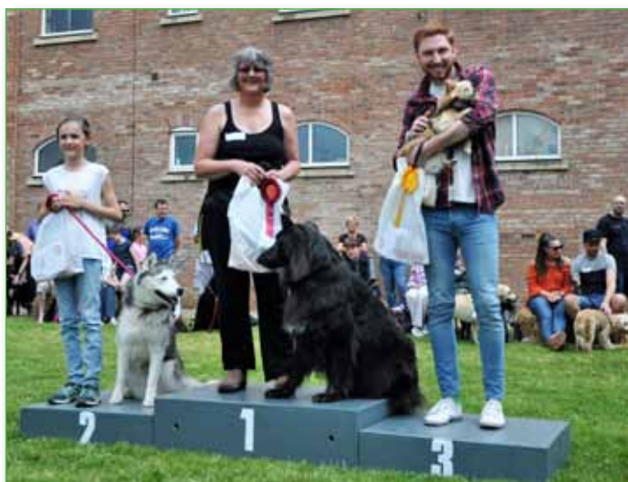
Most Endearing Rescue Winners