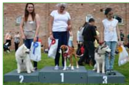
Most Handsome Boy Dog Winners

Most Handsome Boy Dog sponsored by Destiny Hair Design and Prettiest Girl Dog by Cutlers Barbers.