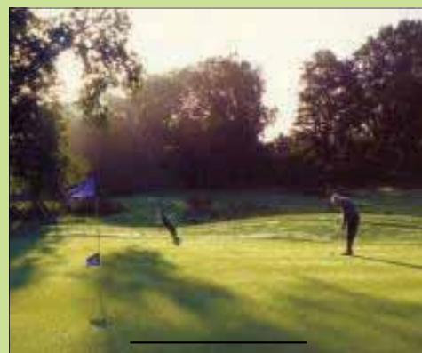
AYLESBURY PARK GOLF CLUB Andrew's Way, Fairford Leys Aylesbury HP17 8QQ