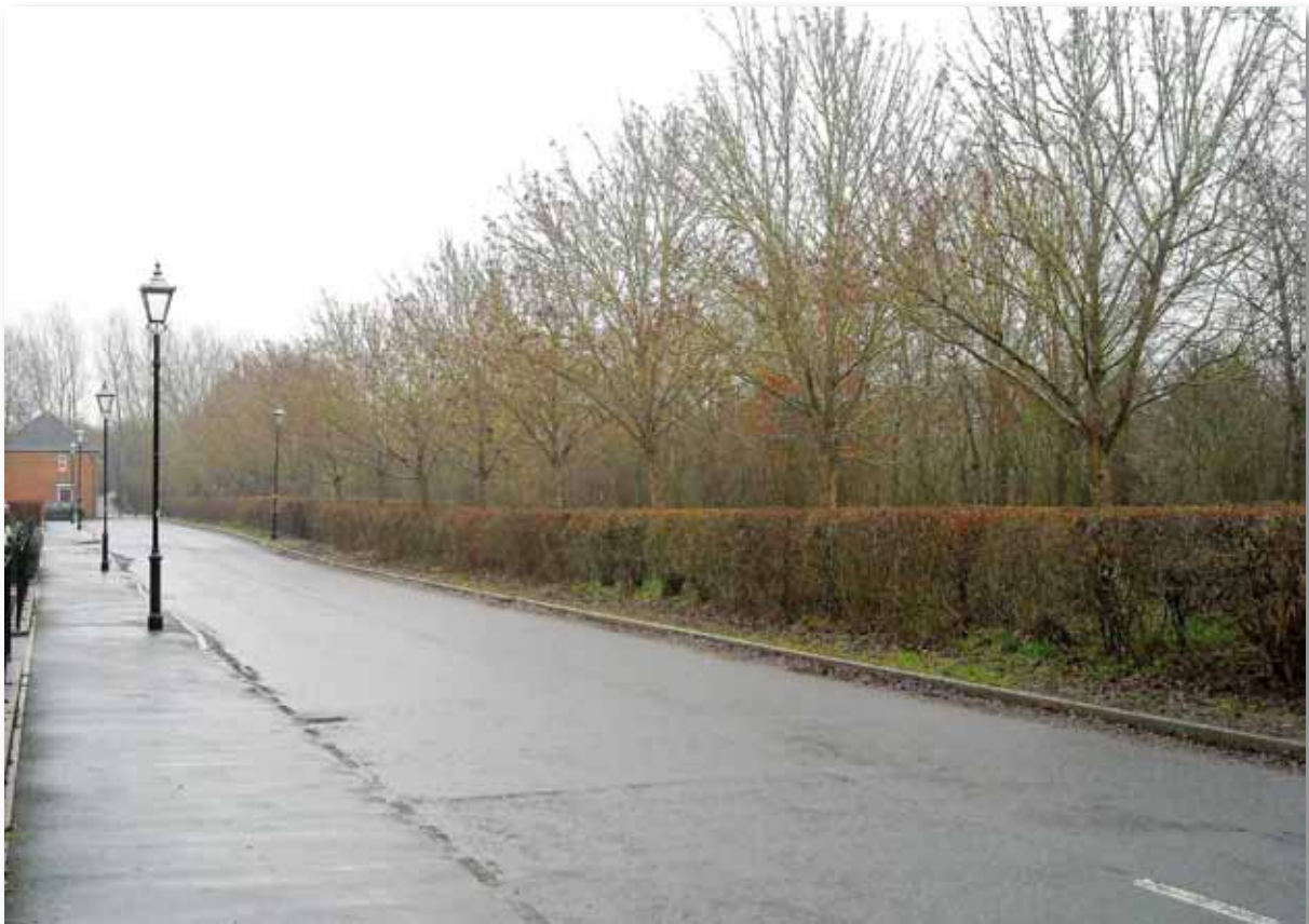
20th January 2018