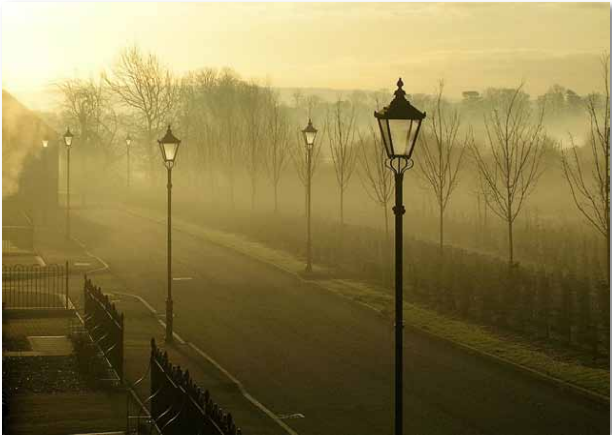
14th January 2005